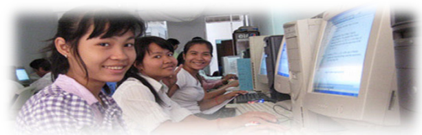
Vocational Training Programs

The organisation conducted the programme in GODDA District of Jharkhand State. Managing committee of the Organisation decided to start